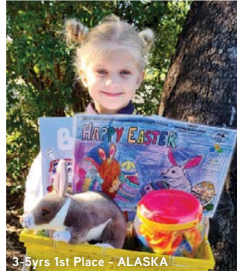
3-5yrs 1st Place - ALASKA