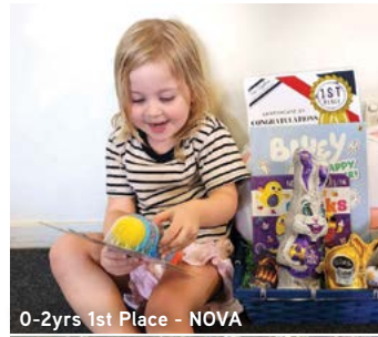
0-2yrs 1st Place - NOVA