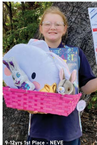
9-12yrs 1st Place - NEVE

Well done to everyone who took part in the competition and thank you to Tieri Foodworks for displaying the entries - they brought a smile to everyone's day as they did their grocery shopping.