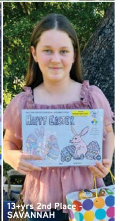
13+yrs 2nd Place - SAVANNAH